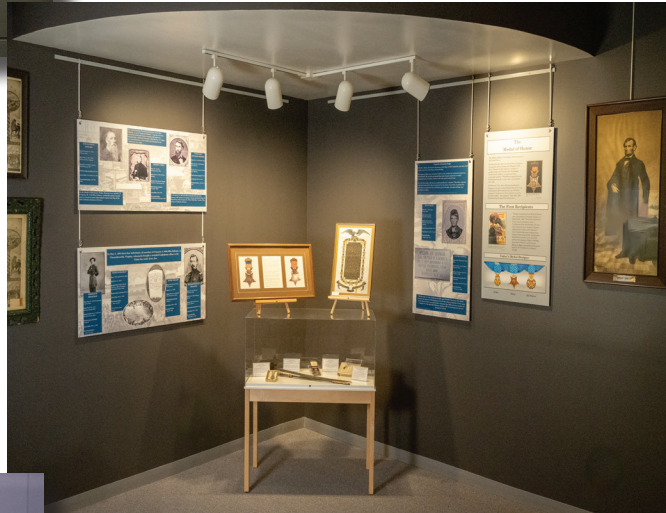
Left: Introducing a new generation to the extensive history of the county through exploration activities.

About the Logo: The CCHS Logo features "Lady Justice" that was installed on the old county courthouse tower about 1920. She was made of metal, and holds the scale cups. The statue was destroyed in the courthouse fire in 1948.