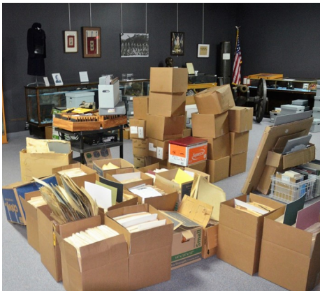
A small sampling of the boxes that have come over from Urbana University!